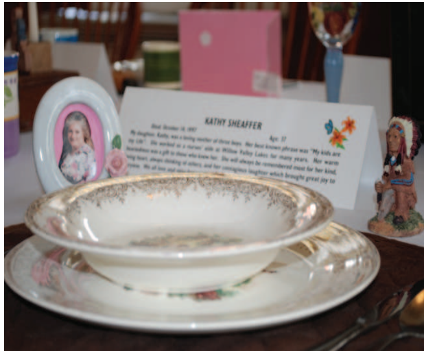
An Empty Place at the Table was an exhibit featured at the YW during Crime Victims' Rights Week April 10 to 16. Twelve place settings were arranged on the conference table in the library, each representing a victim of violence.

Each place setting tells the story of a special person whose place at