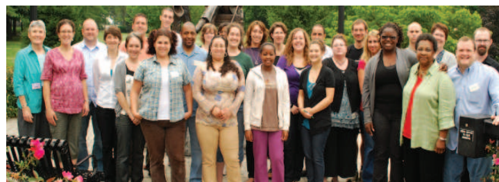
Class photo, June 2010

The Racial Justice Institute (RJI) Part I for 2011 will be held June 20-22 at Thaddeus Stevens College. This intensive 3-day workshop features national trainers to help attendees examine the subtle ways racism permeates our society and provide guidance as to what can be done to counteract them through a series of anti-racism and skill-building exercises.