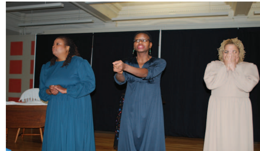
The YWCA Lancaster will host a First Friday Series featuring Sweeter the Berry Community Showcase in June, September and November. The evening's performances will include theatrical plays, music and poetry. The events are scheduled to begin at 4:30 p.m. ending at 8:30 p.m.

In the coming months Theatre for Transformation and the YWCA will