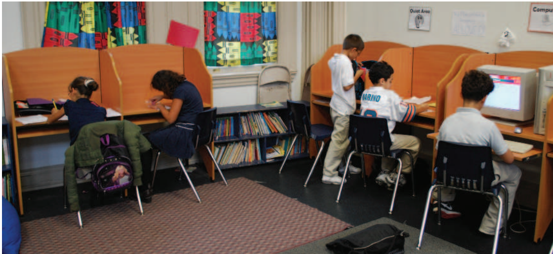
Five children in our After School Childcare Program tackle some homework projects in the new workstation cubicles purchased by the YWCA Empower Ring donor club.

The YWCA Empower Ring donor club recently voted to use the $1,530 it collected to buy student homework stations for the YW's After School Childcare Program.