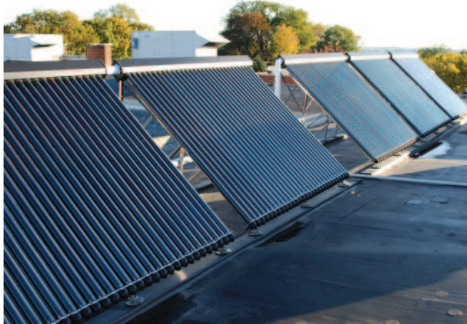
Our rooftop solar panels have cut the YW's water-heating bills in half.

It is estimated that these improvements alone will prevent 101.4 tons of carbon monoxide from entering the air each year...the equivalent of taking 19 cars off the road!